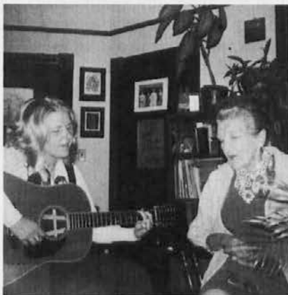
She taught me the pronunciation and melody to "Kje Je Moj Mili Dom."