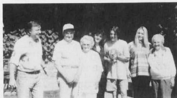
The family gathering in Slovenian in 1997