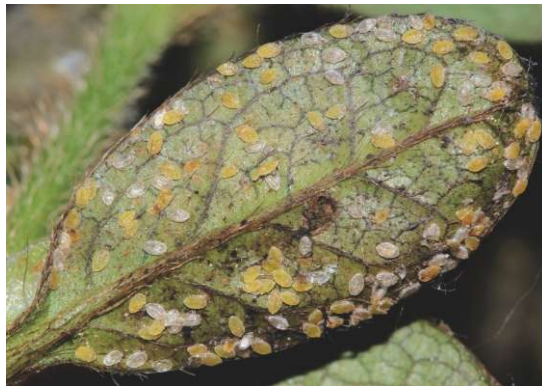
Fig. 8: Ceroplastes ceriferus mature female (life-size 7-10 mm)

Sl. 7: Pealius azaleae - pupariji na spodnji strani lista azaleje