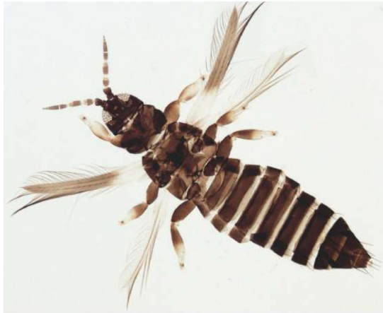
Fig. 2: Dichromothrips corbetti - forked sense cone on the third antennal segment