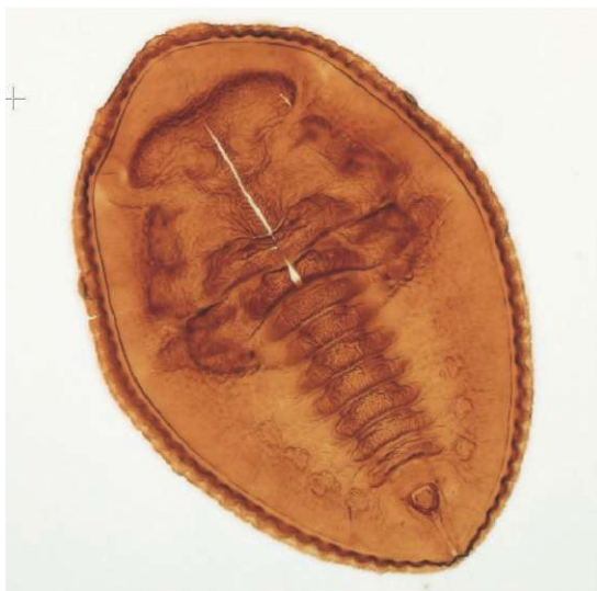
Fig. 5: Aleuroclava aucubae - slide mounted puparium