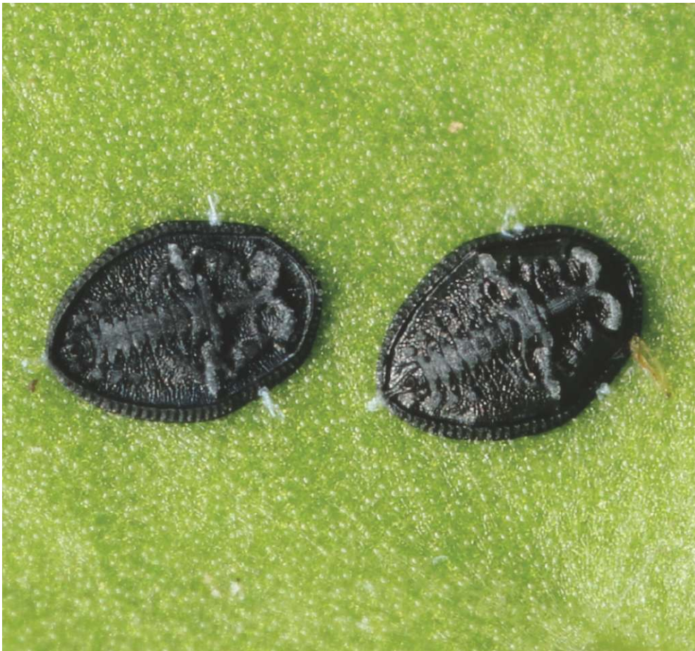
Fig. 4: Aleuroclava aucubae - puparia (life-size 0.7-0.8 mm)

Sl. 4: Aleuroclava aucubae - puparija (n. v. 0,7 - 0,8 mm)