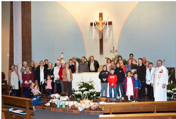
LONDON - St. John the Divine - v tej cerkvi se pogosto zbira slovenska Londonska skupnost k sveti maši. Na Veliko soboto dopoldne smo blagoslovili velikoinočna jedila. Tudi mladi se učijo tradicije in navad od svojih babic.