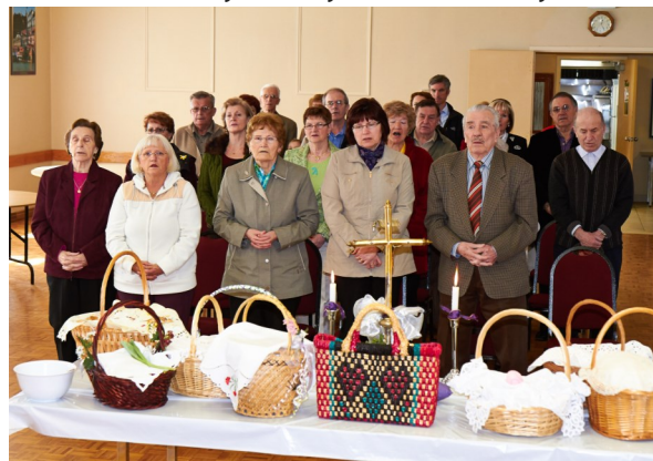
SAVA-BRESLAV - Tudi pri društvu Sava vsako leto blagoslavljamo jedila. Tukaj smo se zbrali opoldne. Lepo okrašene košarice ali »cekarji« odražajo skrb s katero so gospodinje pripravile jedila za blagoslov na Veliko soboto.