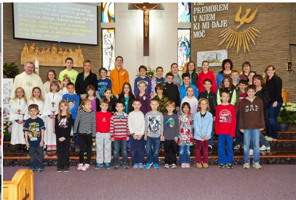
Z otroci in učiteljice sobotne slovenske šole pri sv. Gregoriju Velikemu, se vsako zadnjo soboto v mesecu zberemo pri slovenski sveti maši. Med mašo prepevamo pesmi ob kitari, da lahko otroci lažje sodelujejo.