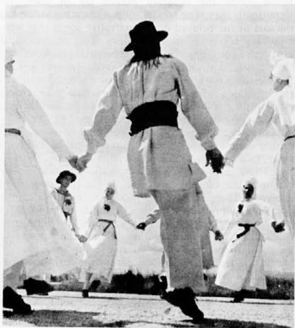
In Bela Krajina, Slovenians dance the KOLO

In the lowland region, the dancers are either in a closed or open circle. This dance is called "kolo." Men and women hold hands or dance in couples. In "kolo" the legs and the feet do most of the movement. A typical dance of the lowland region is the "rojna vrsta."