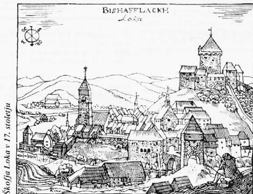
Škofja Loka v 17. stoletju