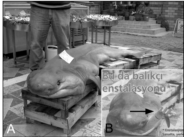
Fig. 3: (a) Sixgill shark displayed at the fishmonger's. (Photo: H. Kabasakal); (b) The photograph of the same sixgill shark, published in a major Turkish newspaper on 3 November 2008, arrow denotes the dummy arm between the jaws of the specimen.

Due to its life-history characteristics (slow rate of growth, long living, low number of fecundity etc.) (Lipej et al. , 2004; COSEWIC, 2007), H. griseus is considered a 'K-selected' species. Therefore, like many other shark species, even the sustainable fishery strategies can cause dramatic declines in the stocks of the sixgill shark. H.