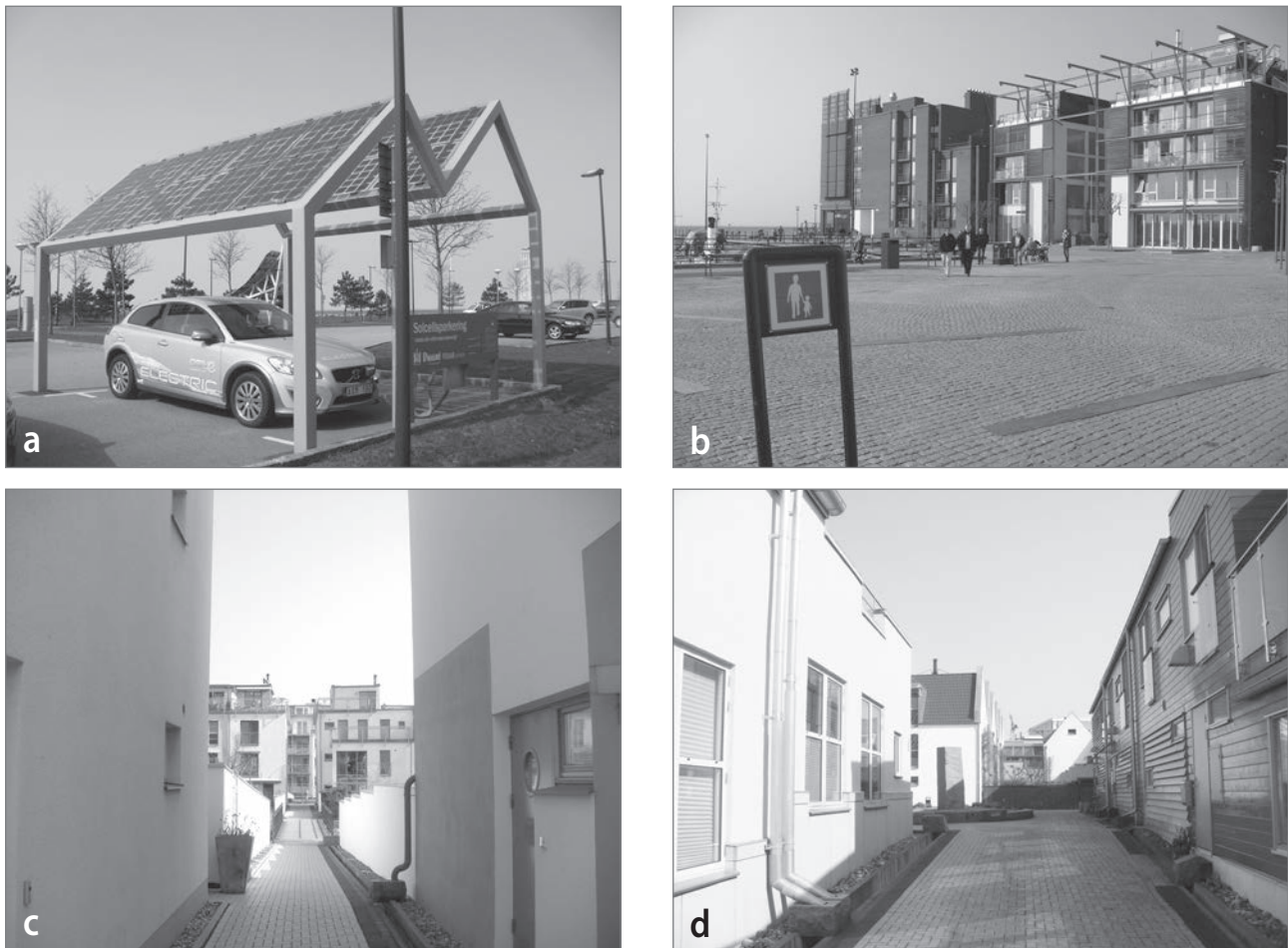
Figure 3: Western Harbour's sustainable transportation and car-free streets; a) an electric car sharing vehicle; b) a car-free public space; c) and d) car-free streets.

gy (15%). Western Harbour is also a good example of applying green innovation to other areas than energy, especially to water and waste management. For example, in some buildings rain-water is used for washing clothes, for watering gardens and for flushing toilets (e.g., in the elementary school); domestic waste is transformed into a new energy source through a waste system with anaerobic vacuum digestion; organic waste is converted to biogas; and flat roofs are usually “green”, covered with various vegetation (Bächtold, 2013).