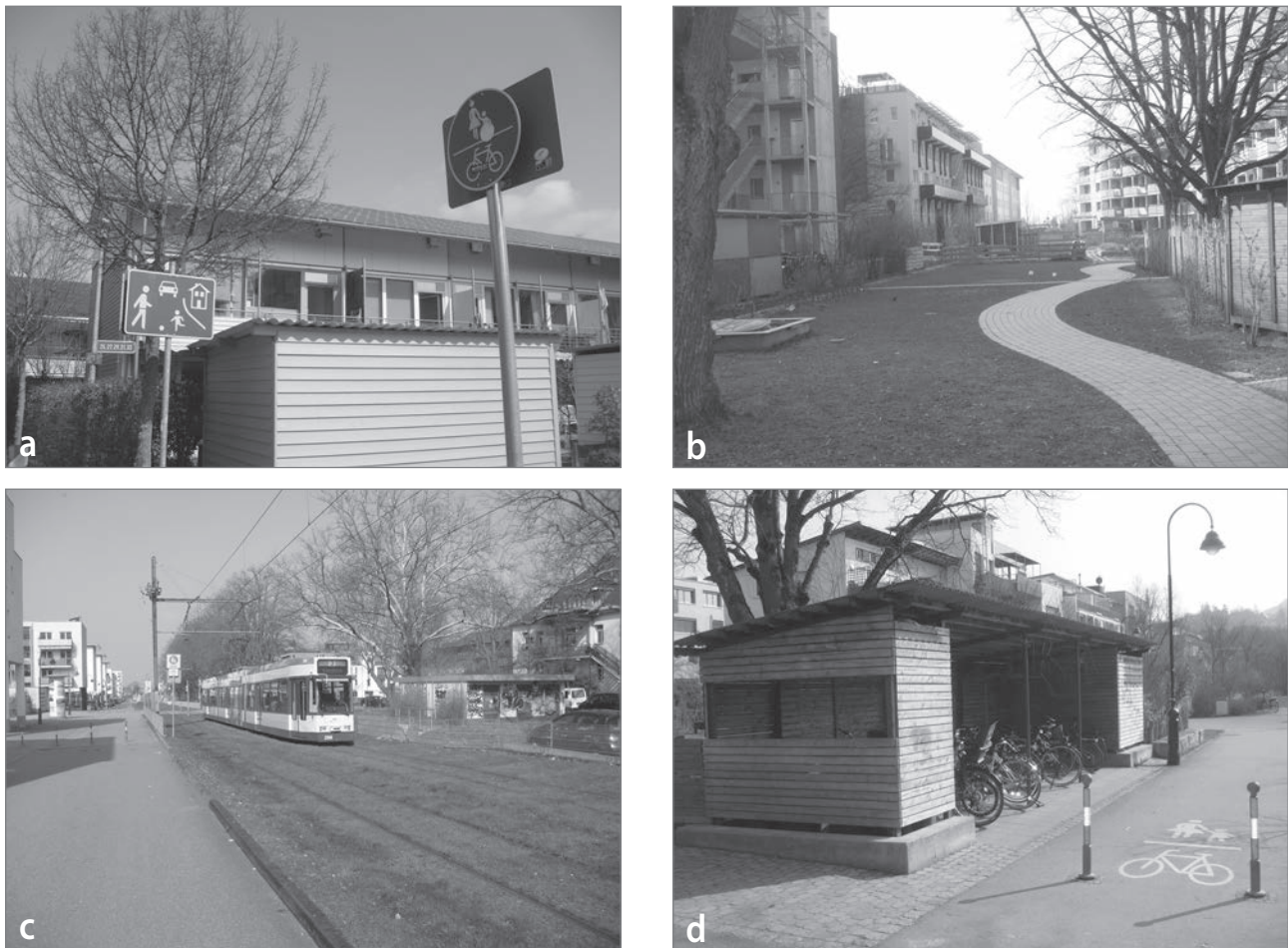
Figure 1: Vauban's sustainable transportation and car-free streets; a) a street as a playground; b) a car-free street; c) a tram; d) a bicycle shed.

testing ground for various techniques with the potential to reduce the consumption of natural resources and increase personal recycling. For example, in the experimental living lab in Vauban – Passivhaus Wohnen und Arbeiten – many innovative green technologies have been adopted, such as vacuum toilet systems and small biogas reactors for kitchen use (Internet 3; Delleske, 2013).