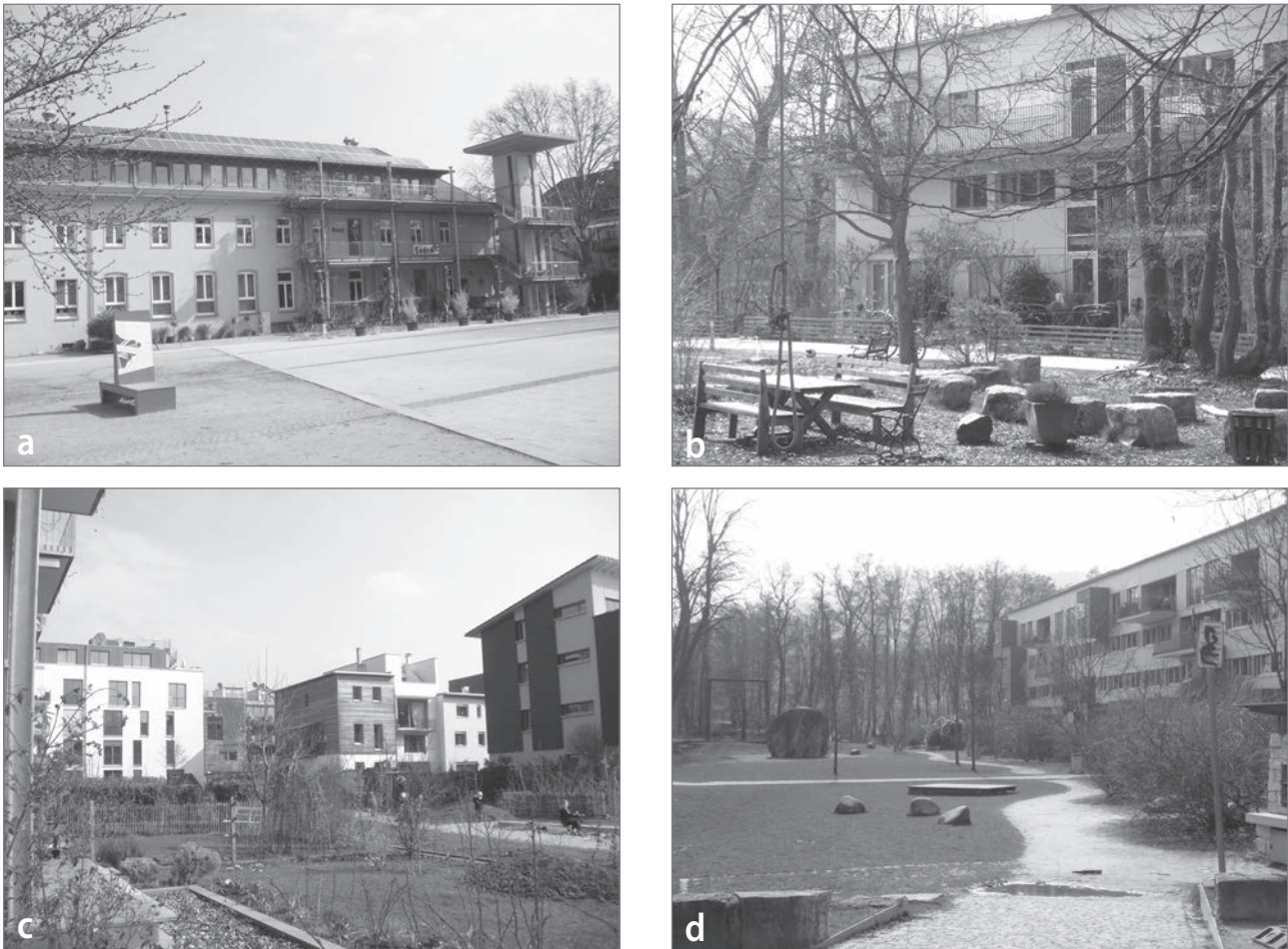
Figure 2: Vauban's public open spaces: a) the neighbourhood community centre Haus 037 and Vauban's Alfred Döblin Square; b) a park; c) an urban garden; d) a park.

offices and a hostel (Fraker 2013). Such a space strengthens the identity of the local urban space and offers the local residents a place where they can meet and communicate. Another important public space in Vauban is the central Alfred Döblin Square ( Alfred-Döblin-Platz ), which is located in front of Haus 037. Alfred Döblin Square is the heart of social life in Vauban, where the organic market (held twice a week) and exchange market (held once a month) take place. Vauban's approach to public urban spaces confirms the findings by Nataša Bratina Jurkovič (2014) that urban renovation plans implemented with the participation of a neighbourhood's residents diminish the risk of inappropriate or even poor programme planning.