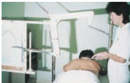
Figure 11. A pantograph, a mechanical device, which traced the contours of the body on paper while a radiographer moved its antenna along the surface of the patient's body.

Still, it was yet another proof of how the shortage of space impeded the development of radiotherapy.