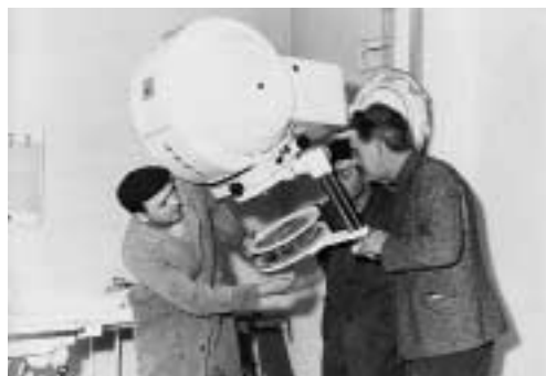
Figure 5. Gamatron, supervoltage device with sealed radioactive source for deep irradiation, the source of Co60 with activity of 111 TBq (3000 Ci), made by Siemens.

The period between 1961 and 1970 was marked by the efforts to build new facilities and acquire larger premises, as well as to expand the research activity. The Institute obtained some new radiotherapy equipment, but the shortage of room hindered its efficiency. Towards the end of the 1960s, the blueprints of a new building for teleradiotherapy were designed. By the year 1968, the bulk of resources necessary for the construction of the new Institute of Oncology had been accumulated in the fund for the construction of the new Institute of Oncology (set up in 1965). The building was to be erected on the right side of the Ljubljanica river. The facilities for the teleradiotherapy were the first to be built, but the plans fell through because of