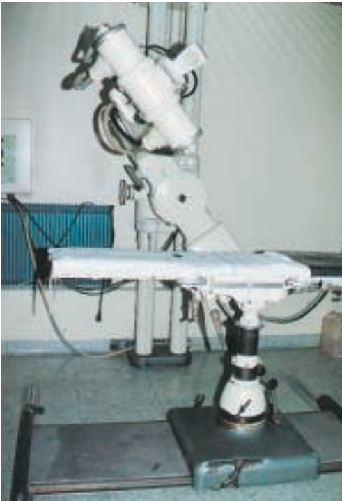
Figure 3. Stabilipan, a 300 kV device for radiotherapy, suitable for superficial irradiation, and allowing 3 to 5 combinations of voltage, made by Siemens.