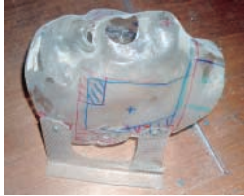
Figure 14. The fixation mask , which secures the patient's position during the treatment.

The second new device was a Japanese Toshiba Transversal Tomograph (Figure 13).