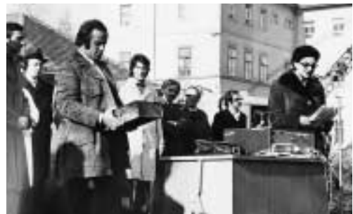
Figure 15. The cornerstone for the new teleradiotherapy building was laid.

In the middle of the 1970s fixation masks replaced cardboard profiles in securing the patient's position during the treatment (Figure 14). The procedure was long, uncomfortable and difficult for the patient. The masks were made in a special workshop, and their fabrication took one whole day.