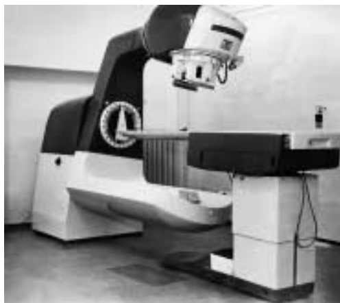
Figure 10. Theratron 80 , the supervoltage device with sealed radioactive source for deep irradiation, the source of Co60 with activity of 222 TBq (6000 Ci), made in Canada.

In 1969, another sealed source apparatus (Co60) joined the slightly out-dated and overloaded Siemens Gamatron . It was a Theratron 80 , 222 TBq (6000 Ci), made in Canada (Figure 10). It was provisionally set up in the adapted former garage near the isotopic laboratory. Its specialty was the so-called »beam stopper«, which intercepted the exiting radiation, so that the room needed considerably less shielding than in the case of devices with no such accessory.