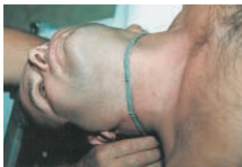
Figure 6. The lead wire for tracing the body contour, in which the position of the tumour and of other organs were marked while devising the irradiation plan,

The first supervoltage device with sealed radioactive source used at the Institute of Oncology (in 1962) was a Siemens Gamatron (Figure 5), a Co60 unit, with the initial activity of 111 TBq (3000 Ci). The activity of the cobalt source (Co60) was 111 TBq, and its head made of wolfram, which shielded the environment from radiation, weighed more than half a ton. It was used for deep irradiation, and soon nick-named the Cobalt Bomb . In addition, two roentgen diagnostic devices were bought. They were used for tracing the localizations of irradiated fields and the position of brachytherapeutic sources of radium, as well as for diagnostic purposes. 5