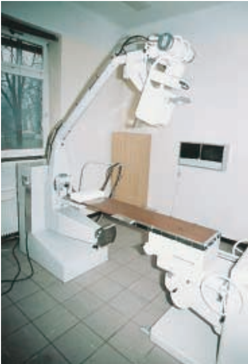
Figure 13. Transversal Tomograph , which enables the contactless tracing of body contour.

The Teleradiotherapy Department moved to the renovated building of the Internal Clinic, which became the new building C of the Oncological Institute. All existing equipment was transported there, except the Gamatron , which went out of use. Two new roentgen devices were bought. The first one was the simulator Ximatron TEM (Figure 12), used for the preparation and planning of radiotherapy. The apparatus simulated the conditions on irradiation devices, determined the irradiation field in the patient, and tested the shielding. One of the major advantages of simulators is that the irradiation field is immediately visible on the screen. Since the table with the patient is movable as well, any aberration can be immediately detected and rectified, without the time-consuming radiography. This must be done only at the end, for verification, possible fabrication of shields, and records.