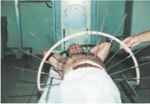
Figure 7. Needle contour device with radially arranged metal needles for tracing the body contour.

The body contour, in which the position of the tumour and of other organs was marked while devising the irradiation plan, was traced with the help of a lead wire (Figure 6). It was wrapped around the patient, then carefully removed and copied to tracing paper. The method was very imprecise, since distortions of the wire were inevitable during its removal from the patient.