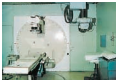
Figure 12. The simulator Ximatron , used for the preparation and planning of radiotherapy, made by TEM in United Kingdom.

In spite of the fact that everything pointed to the Oncological Institute moving to a new location towards the end of the 1960s, the early 1970s clearly revealed that other projects had priority. The Act on the Construction of the University Clinical Centre (passed by the Assembly of the SR Slovenia in May 1981) stipulated the construction of the TRT on the left bank of the Ljubljanica river, on the premises of the old auxiliary units of the Clinical Centre. The postponement was a huge blow to the Oncological Institute, curtailing its spatial perspectives. To compensate for that, the Oncological Institute was given the old building of the Internal Clinic, which was renovated with the funds for the construction of the new Oncological Institute - the renovation cost 500 million dinars. 3