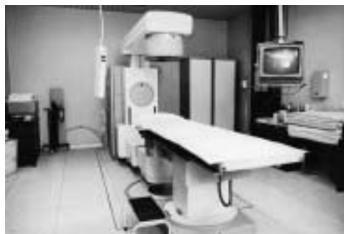
Figure 18. The Phillips simulator, which went out of use in 1999.

All the existing equipment, except the Gamatron, were moved to the new building. Two new supervoltage radiotherapy devices were installed there as well - a new Phillips linear accelerator SL75/20 (Figure 16), which was used until the year 2000, and a sealed source radiation (Co60) apparatus of the same producer, which is still being used (Figure 17). In addition to the Ximatron simulator, a new Phillips simulator was installed (Figure 18), which went out of use in 1999.