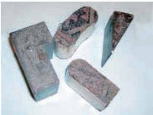
Figure 8. The standardized lead blocks of different shapes for protection the healthy tissue around the irradiated area.

In the beginning, the protection of healthy tissue around the irradiated area consisted of