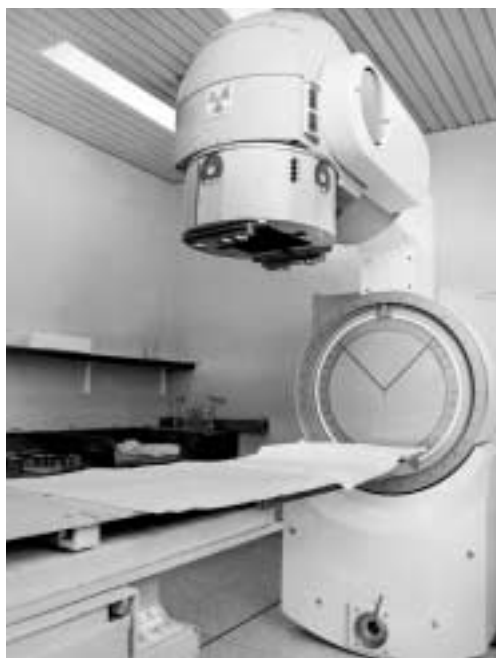
Figure 17. A sealed source radiation (Co60) device made by Phillips . It is still being used.

After the disappointment in 1971, the struggle to overcome the shortage of space continued. The staff of the Institute of Oncology became more optimistic on November 1974, when the cornerstone for the new teleradiotherapy building was laid (Figure 15). The construction took three years, and the Teleradiotherapy Department moved to new premises in 1977.