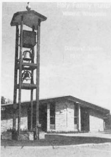
Holy Family Church of Willard was built in 1967.

With each convention, Branch 102 tried to enhance the activities with something different and on September 16, 1984, which marked the date of the fifth convention, Slove-