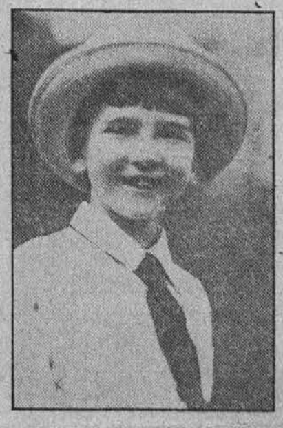
Kralj Peter II. kot deček