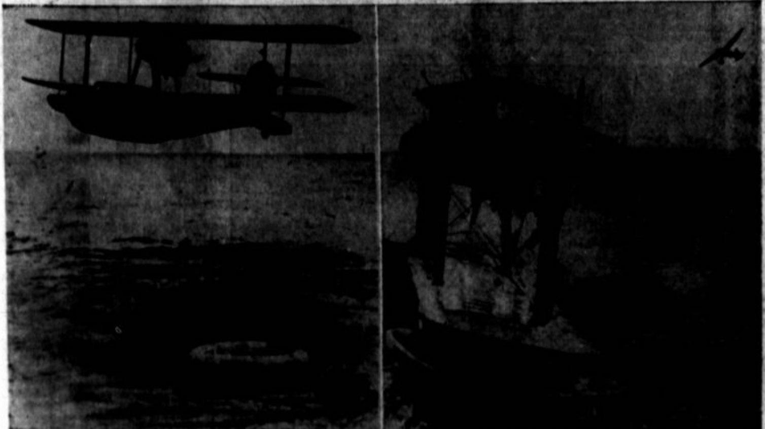
Many an R. A. F. member lives to fight another day through the courageous, efficient work of the air-sea rescue service. Special amphibian planes constantly fly over the channel on the lookout for English air-