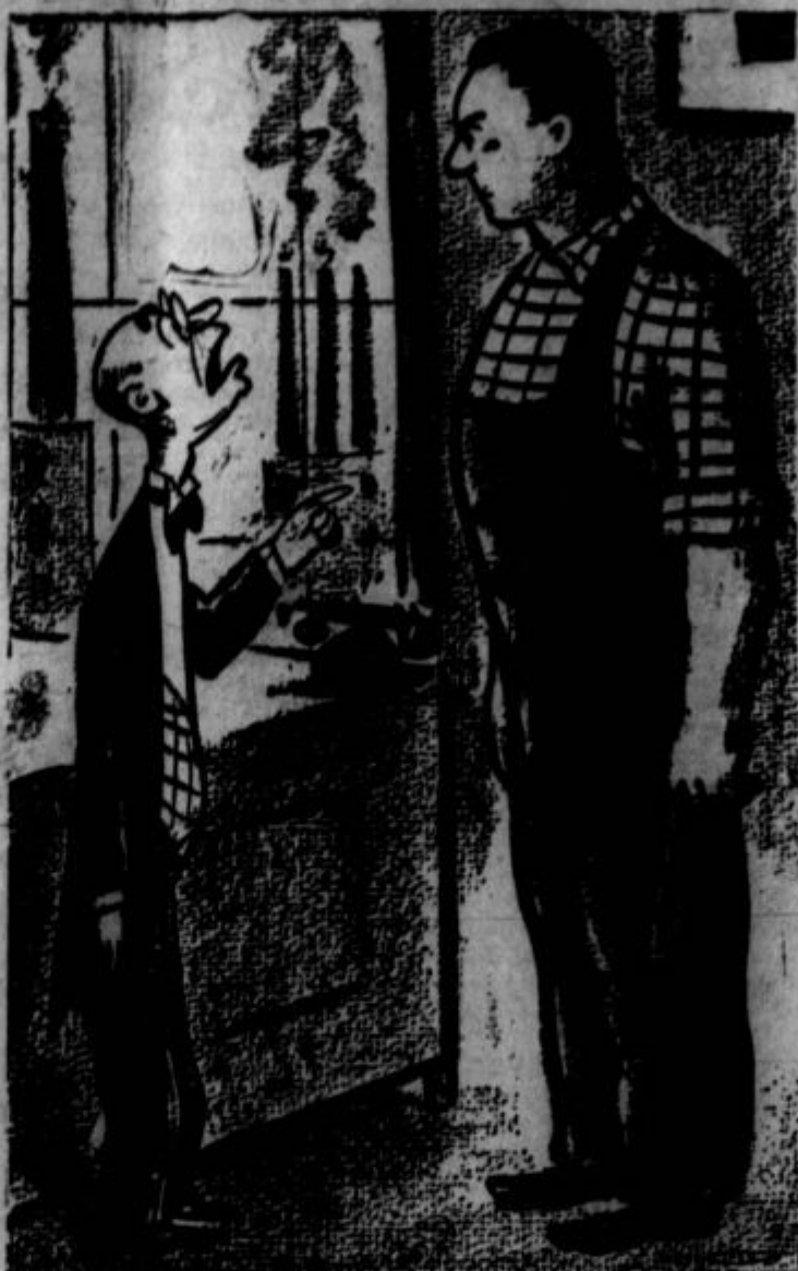
"Only God knows how I survive the heat."