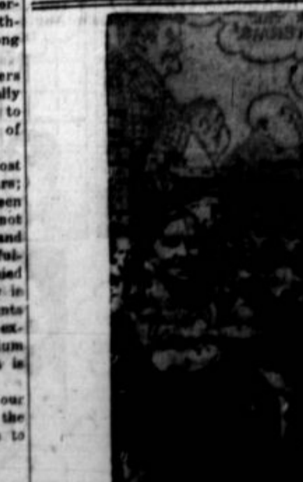
Women from Soviet Republic Azerbaijan on Parade in Red Square, Moscow.

Three hundred new icicles have been added to the Swisa Village scenery in Sun Valley at the New York World's Fair. There are now 5,000 icicles that look just like the real thing defying the midsummer sun. The artificial icicles cost from $1.50 to $6 each.