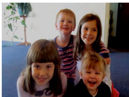
Otroci v pričakovanju pirhov

BBQ kosilu je sledila razprostitvev na plesišču, za otroke pa razdelitev pirhov, kot to kaže spodnja slika. Kljub hladnemu vremenu je udeležba bila še kar zadovoljiva in družabna.