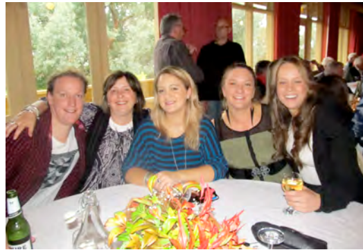
"Our next generation" - mladina