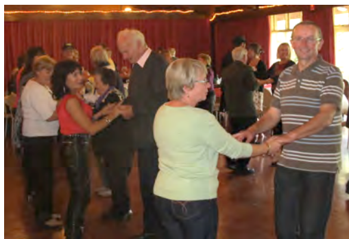
Tako smo plesali na velikonočni ponedeljek

Ta dan je bil v naši družbi učitelj plesov, kateri je najel našo dvorano za redne plesne vaje vsako sredo zvečer. Vabljeni k udeležbi. Svoj talent je izkazal na velikonočni ponedeljek, ko je zvabil na plesišče številne udeležence tega dne in predstavil in učil kako se pleše malo drugače, kot smo tega vajeni na klubu.