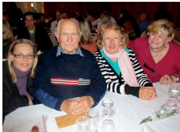
Celebrating Mothers' Day