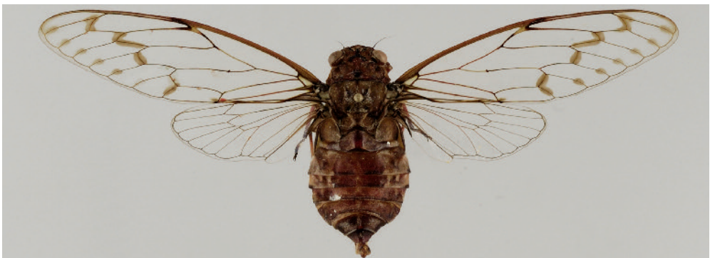
Fig. 1: Nabalua gogalai , male holotype.

Initially we have hesitated in attributing this new species to Nabalua since the males of this species have some peculiar features that are not found in other Nabalua species, viz., a very broad male abdomen, a brownish, instead of black marking of