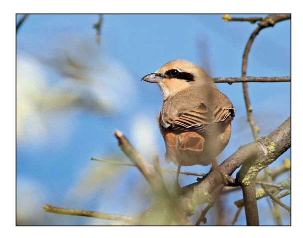
Figure 3: Isabelline Shrike Lanius isabellinus , Durankulak Lake, northeastern Bulgaria, 28 Sep 2014

The bird was identified as a male (Figure 3). It had a typical structure of a shrike. The bill was greyish with dark edges. The supercilium was thin and white to creamy in colour. The mask was black, running from the forehead across the lores to the ear coverts. The primaries were blackish with buff edges. There was a small whitish patch at the base of the primaries, visible as a small speculum. The upperparts were uniformly