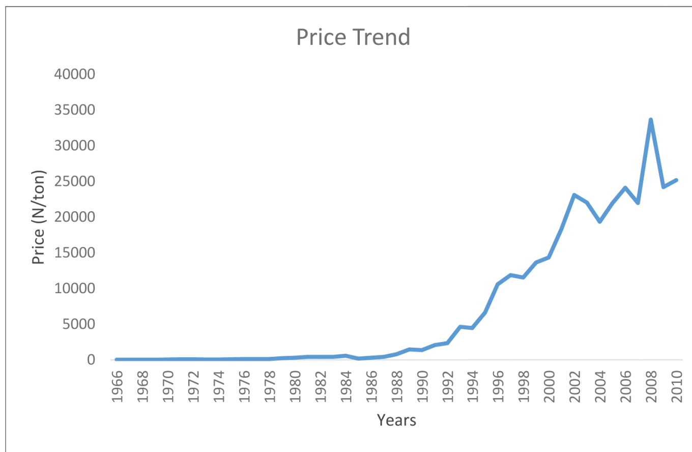
Fig. 2: Trend analysis of cassava prices in Nigeria

around 2008 can be attributed to the glut in the market at the period. From then onwards, there was an undulating increase in the trend of cassava price.