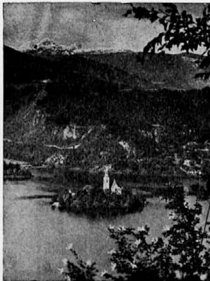
Blejsko jezero, biser slovenske zemlje.

Oj Triglav, moj dom, četudi je svet začaral s čudesi mi večkrat pogled, tujina smekljaje kazala mi kras, sem nate le mislil ljubeče ves čas, o tebi sem sanjal sred' svetlih dvoran; Oj Triglav, moj dom, kako si krasan!