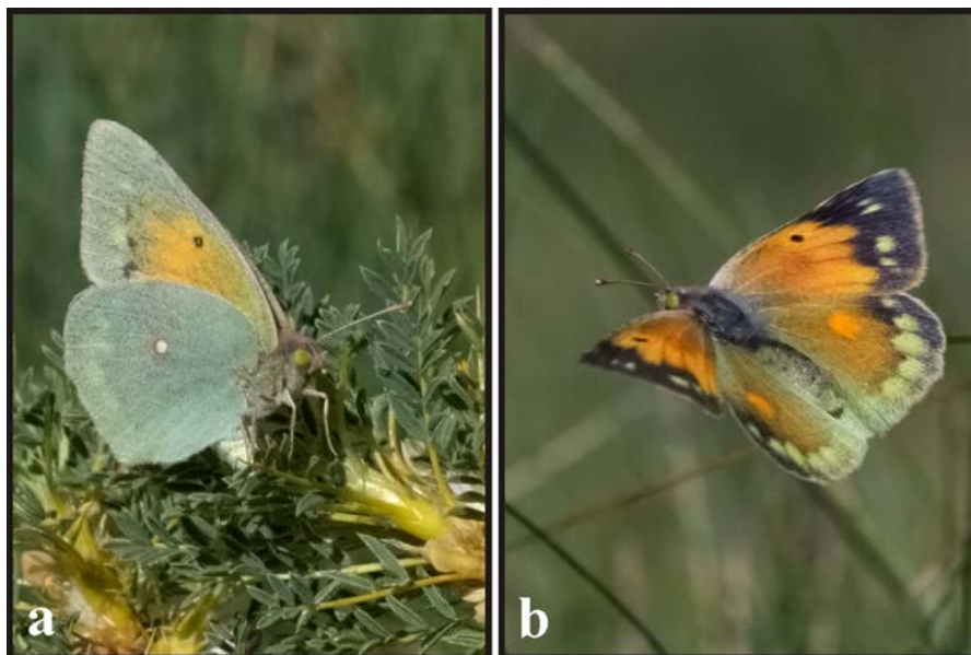
Figure 3. Female ovipositing on Astragalus thracicus (a) and gliding along the slope searching for oviposition spot (b).

Slika 3. Samica pri odlaganju jajčec na Astragalus thracicus (a) in iskanju mesta za odlaganje jajčec (b).