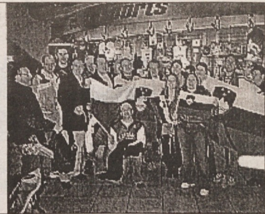
Slovenians celebrate in front of Raptors concession stand.