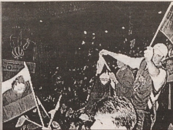
Slovenians cheer their favorite players