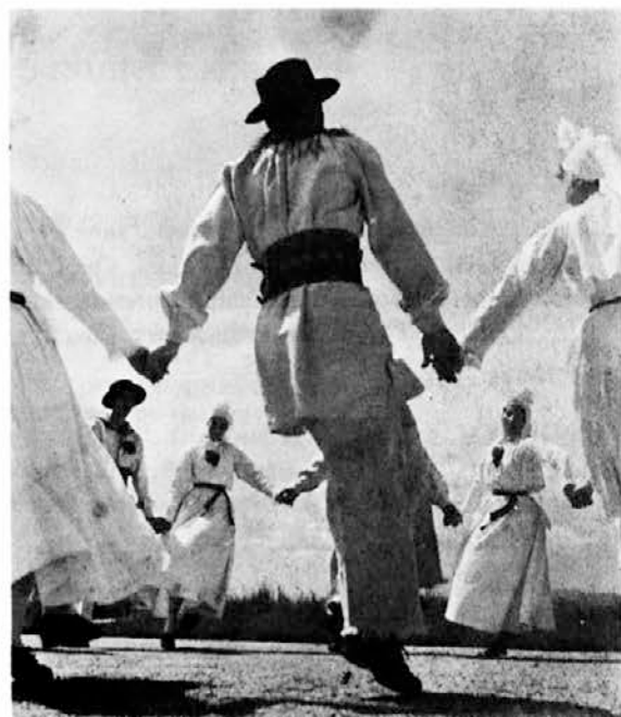
Kolo Dancers of Bela Krajina