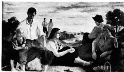
Relaxing on the fields - Počitek na polju (Stane Kregar)

In the history of human salvation we see how God called men in every age, in the old Testament and new Testament, to stand up and be counted. Even when it is not fashionable to stay on the side of the divine law, God expects that a christian man takes his position on His side. — This month we celebrate Fathers' Day, the day of the man who was called by God to be strong in faith, to be unafraid, to be a leader, to be a man the Almighty can use for His own design.