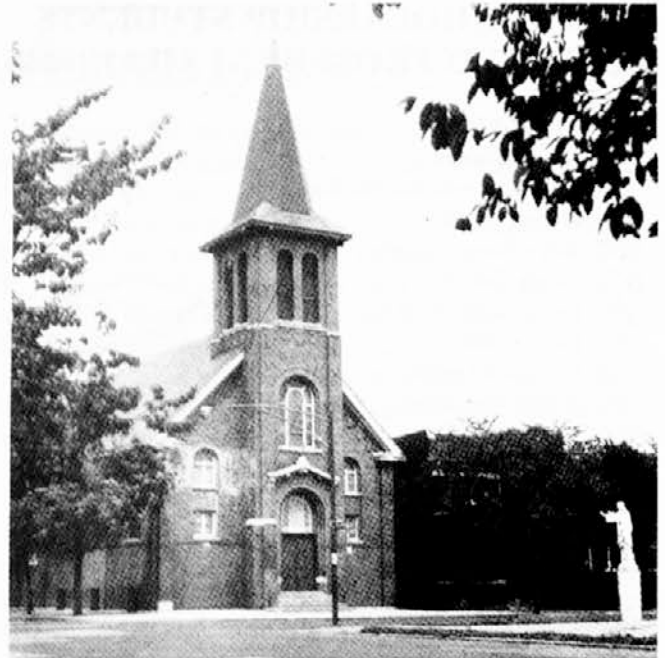
St. Stephen's Church in Chicago has been the center and focal point of all the activities of Br. 2 since its inception. In 1998, the church will celebrate its Centennial!