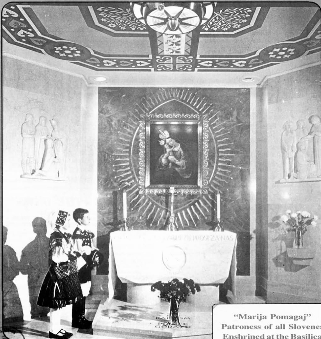
“Marija Pomagaj” Patroness of all Slovenes Enshrined at the Basilica Washington, D.C.