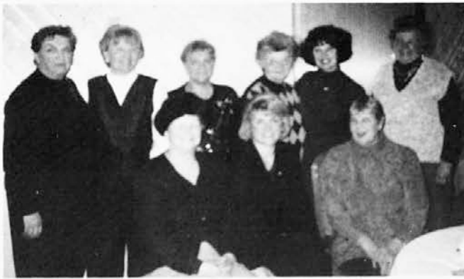
Mothers/Members of the Year of Br. 101 – all of them!