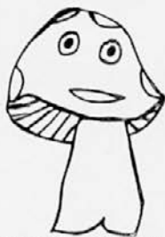
Moris' body was a golden honey brown and his head a burnt red.

Still seeing confusion on the professor's