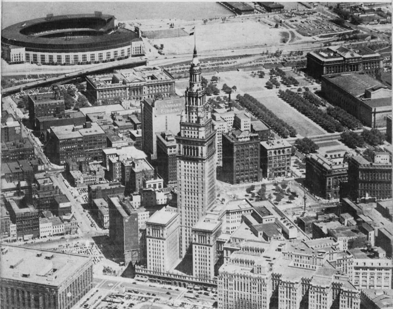
The Cleveland Terminal Tower, looking North toward the Stadium and Public Auditorium.