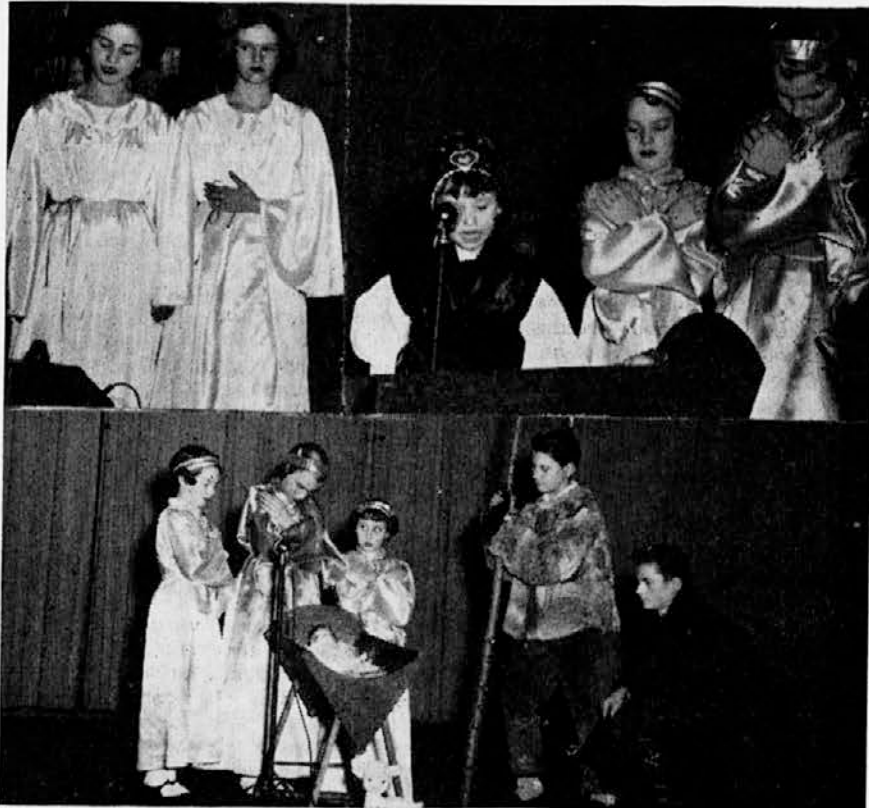
CHRISTMAS SCENE DEPICTED BY JUNIORS OF BRANCH NO. 2, CHICAGO