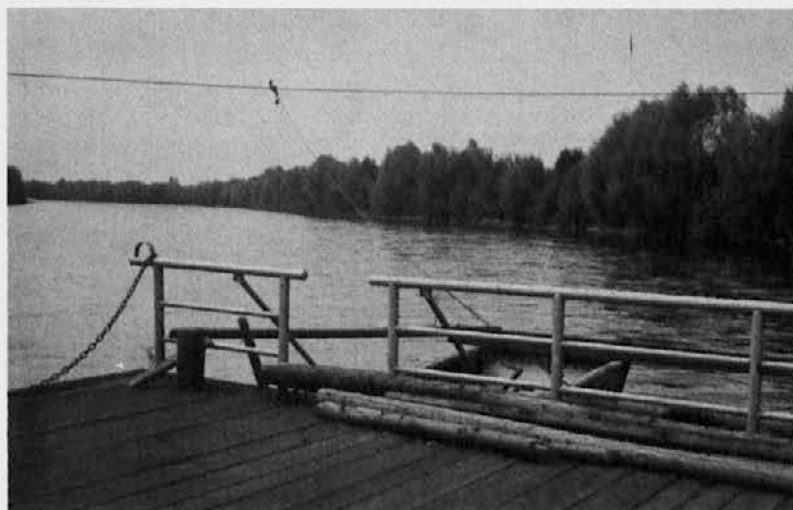
THIS IS A BROD

It was a little scary, but we giggled all the way across and back!