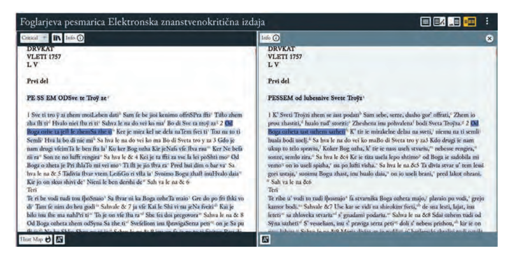
Figure 6: The EVT tool enables a number of dynamic ways to display the digital scholarly edition, e.g., by showing the main text on the left and the selected version of it on the right.

From this perspective, Foglar's hymn book is a particularly demanding example. On the one hand, with eight previously recorded versions of textual transmission or tradition, it requires a classical Western European type of scholarly edition; on the other hand, a Slovenian philological type of scholarly edition is determined by the contrasting method involving the diplomatic and the critical transcript of the main text. In the future, this need should also be met by adjustments made to its reading display solutions.