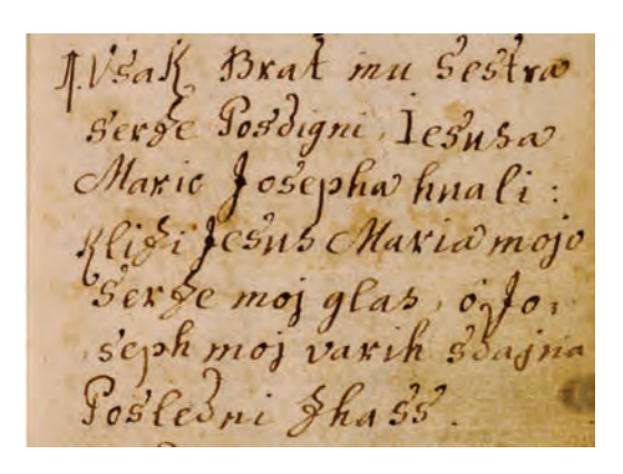
Figure 2: The original variant of the first stanza of Pesmi o svetem Jožefu

In addition to verse lines, stanzas and refrains, rhyme and foot can be specifically encoded in a machine readable format. However, this markup in our scholarly edition have not yet been taken into account. The rhyme patterns can be documented with the @rhyme attribute, while the @label attribute is used to specify which parts of a rhyme scheme a given set of rhyming words represent. The value of this attribute is usually one of the letters of the rhyme pattern.