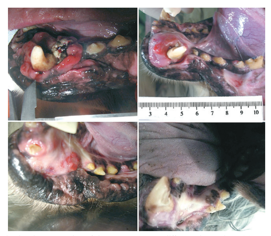
Figure 1: The figure is showing regression of the tumor mass at different time points. (A) tumor mass at the time of the first therapy. (B) clinical regression of the tumor at 4 weeks after the first therapy and before the second therapy. (C) four months after the first of the tumor therapy the size of the tumor significantly decreased. (D) seven months after initial therapy complete regression could be seen

A 15-year- old male castrated English setter, weighing 22 kg, was presented to the Small animal clinic of Veterinary faculty Ljubljana for evaluation of a rapidly growing oral mass. History of the patient was unremarkable, except persistent moderate proteinuria of 5 years duration, which has been well controlled with appropriate diet and enalapril. Clinical examination findings were within normal limits, apart the large mass at the left mandibular canine tooth. The client declined full staging including head CT scan and diagnostic imaging for possible distant metastases. Therefore only partial staging was performed, including complete blood count with white blood cell count (performed using an automated laser hematology analyzer with species-specific software Advia 120, Siemens, Munich, Germany) and detailed biochemistry panel (performed using automated chemistry analyzer RX-Daytona, Randox, Crumlin, UK). Biochemistry panel consisted of serum concentrations of glucose, urea, creatinine, Na, K, Cl, Ca, total proteins, albumin and serum activity of alkaline phosphatase, alanine aminotransferase and creatine kinase. All parameters were within normal limits except moderate, clinically