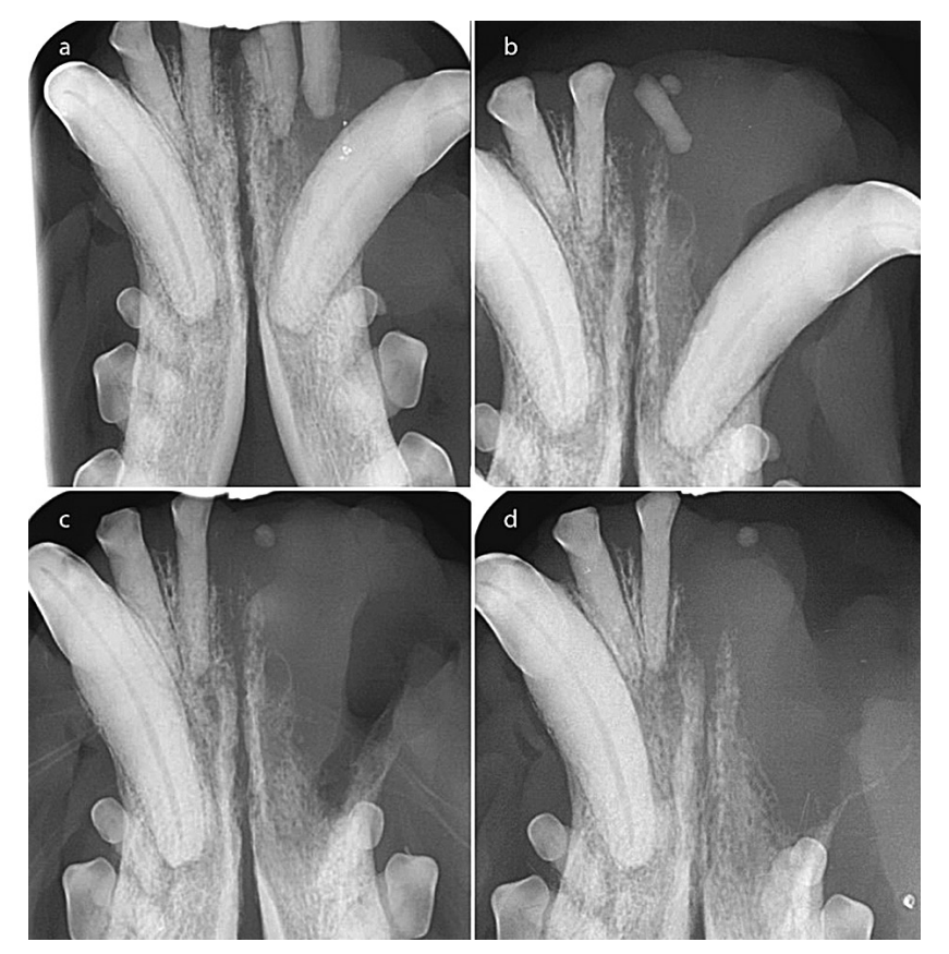
Figure 2: (A) Dental radiograph, occlusal view of the rostral mandibles at initial presentation. Geographic bone loss at the left mandibular incisor and canine teeth was visible on dental radiographs, and permeative pattern of bone loss in the symphyseal region suggested bony involvement of both rostral mandibles (T3b). Clinical assessment of radiographically abnormal (fractures or abrasion) left mandibular incisor teeth was impossible as they were embedded in the tumor mass. Right mandibular third incisor tooth is missing. (B) Dental radiograph, occlusal view of the rostral mandibles at 4 weeks. Radiographically visible severe progression of the osteolysis. Left mandibular first incisor tooth and near total loss of attachment at the left mandibular canine tooth, therefore these two teeth were removed (C). The round poorly mineralized structure remained, as it was hidden in the soft tissues of the tumor. (D) Dental radiograph, occlusal view of the rostral mandibles at 10 weeks. Radiographically subjectively decreased osteolysis progression

After discussing possible treatment options, including bilateral rostral mandibulectomy in combination with radiotherapy, the client elected ECT and EGT. During the next four months, four therapy sessions were performed (Graph 1). Each session was performed with the dog under short (approximately 30 min) general anesthesia, starting with ECT using intravenous application of bleomycin (Blenoxane, Bristol-Myers, Princeton, USA; 3 mg/ ml) at the dose 0.3 mg/kg, followed by delivery of electric pulses with electric pulses generator Cliniporator™ (IGEA s.r.l., Carpi, Italy). Train of 8 pulses was applied, each pulse of 100 µs duration and amplitude to electric distance ratio of 1300 V/cm and frequency of repetition 1 Hz, using two parallel stainless steel plate electrodes with 6 mm distance between them. This procedure was followed