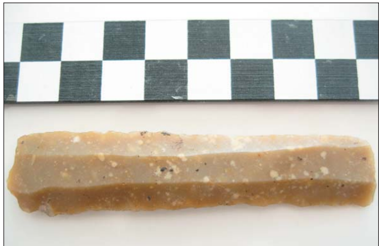
Fig. 2. Balkan flint blade from Kaznica-Rutak

Obtaining raw materials for everyday use was in accordance with familiar models of exploiting raw material in the regions populated by cultural groups of the Early Neolithic. The Starčevo culture settlers in the interfluvian region were very familiar with their surroundings and the resources it offered, and had developed systems for the supply and distribution of raw materials and semi-products. Their selection