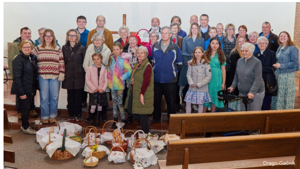
Blagoslov velikonočnih jedi pri slovenski skupnosti v Londonu.