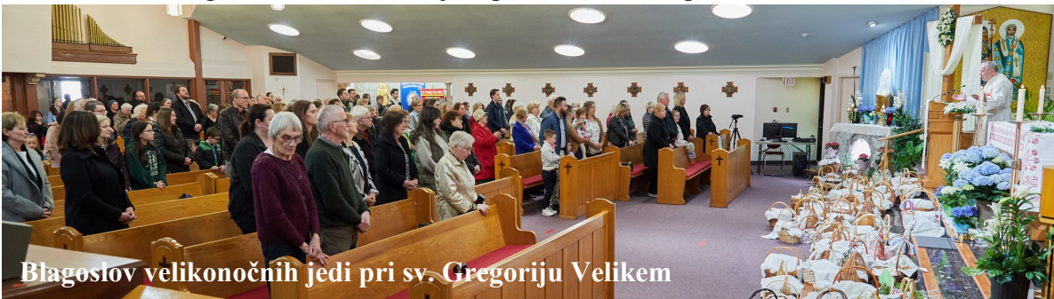
Blagoslov velikonočnih jedi pri sv. Gregoriju Velikem