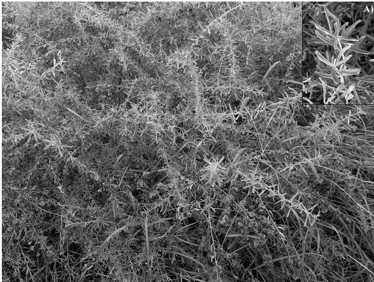
Figure 1: Atriplex canescens var. gigantea at Medenine, southern Tunisia. A) details of leaves.

Description: Shrubs, dioecious, 10–18 dm, not armed. Leaves persistent, alternate, sessile or shortly petioled (petiole 1–4 mm long), blade mostly linear, (16-)20-40(-45) × (4-)5-6(-7) mm, margin entire, apex obtuse, green, pubescent of both surfaces. Staminate flowers arranged in clusters (about 3 mm wide), the clusters forming panicles-like structures (up to 15 cm long). Pistillate flowers arranged in panicles-like inflorescence, 8–14 cm long. Fruiting bracts-like cover 15–30 mm wide, on stipes up to 8 mm long, with 4 wings extend-