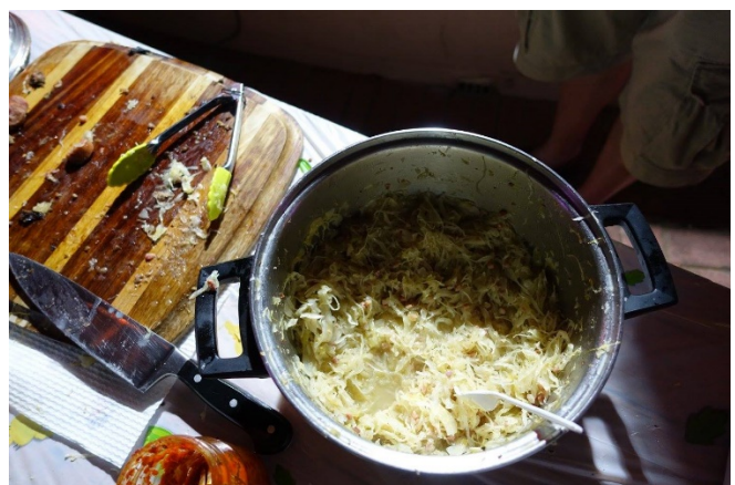
Ivan's mum's Ivanka superb sauerkraut.