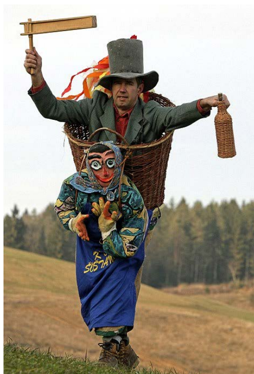
Pust (Carnival) in Slovenia - a man dresses as a 'woman carrying a man'

internet: http://www.slovenianaustrianchamber.com.au/ find us on Facebook