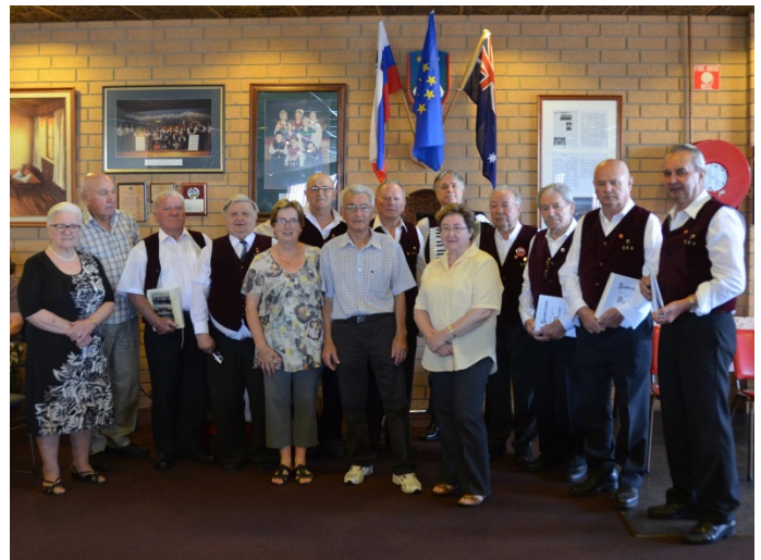
A group photo of all of the performers.