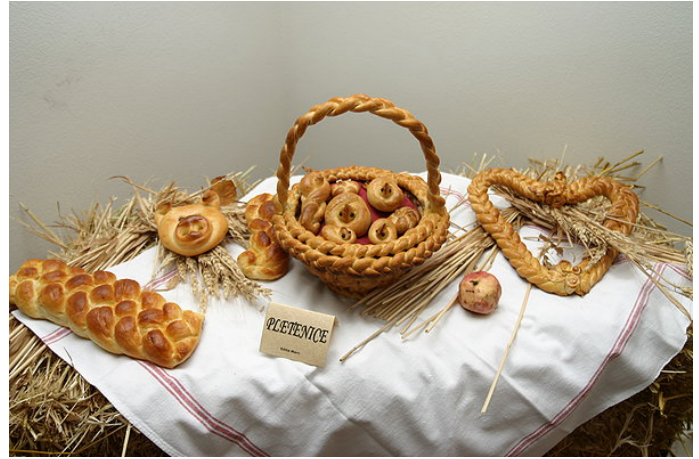
Specialty bread from Ajdovščina Slovenia.