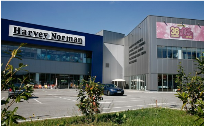
Harvey Norman Novo mesto

The Australian retailer Harvey Norman has 5 stores in Slovenia and they are in Ljubljana, Koper, Celje, Novo mesto, and Maribor.