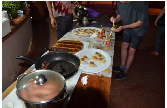
The excellent presentation.