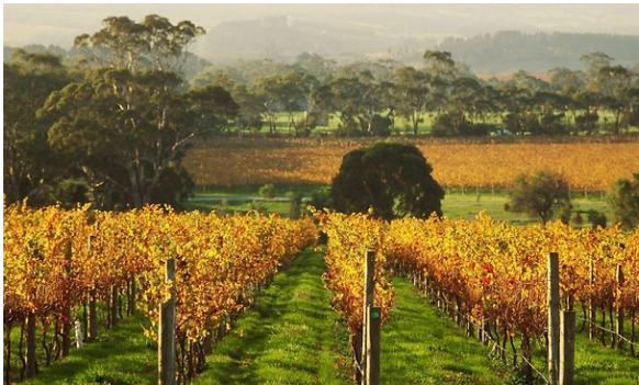
Autumn at Penny Hill Vineyard at McLaren Vale, South Australia.

Slovenian Club is open every Sunday for socializing and dinner. You are all warmly welcomed.