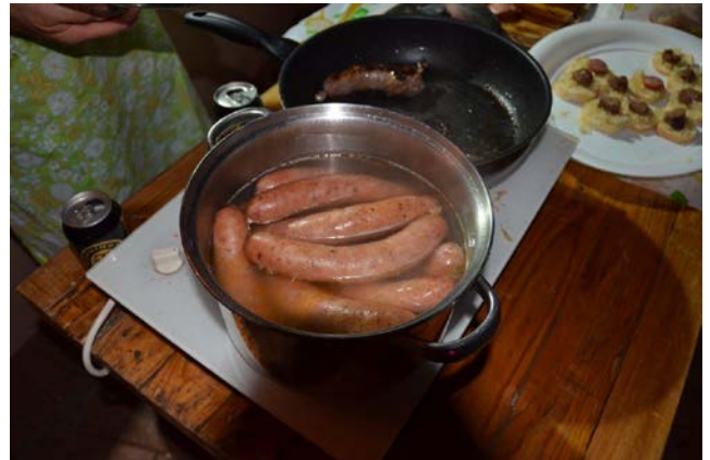
Kransky being cooked to perfection.