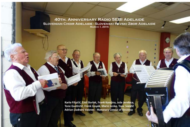
“Rom pom pom”