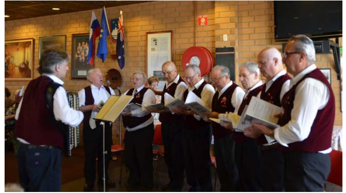
The legendary Slovenian Choir Adelaide sang a number of Slovenian songs.

Now we need to get the sons and daughters of this choir to form a singing group because we know the apple does not fall far from the tree! The audience would love to hear you sing so come on down.