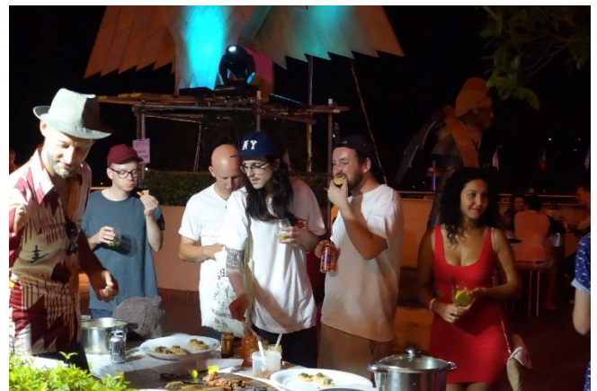
Plenty of interested tasters.