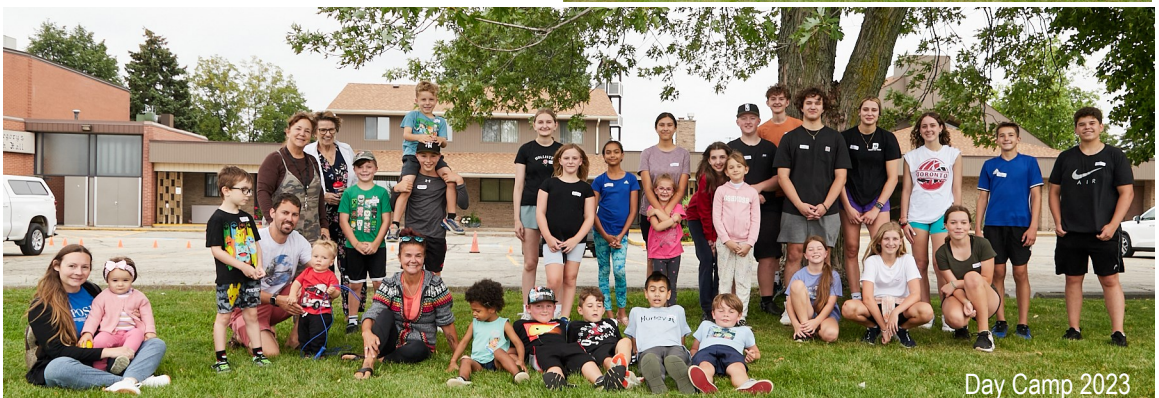
Day Camp 2023