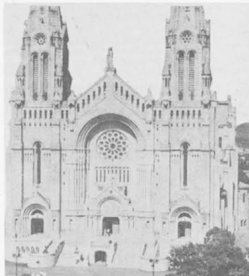
Shrine of St. Anne de Beaupre

At 7:00 P. M., the bells tolled for the recitation of the Rosary. The Our Father is said in French and the Hail Mary in English. Coming down from the Holy Stairs, there are many people in wheel chairs and lying on cots, all waiting. The Novena for St. Anne is from the 17th of July to the Feast on the 26th of July and many people are there from the first day to see the shrines located from here to Montreal. Mass was at 9:30 P. M., with Communion, and there we saw all the people, with wheel chairs being wheeled into church, some with Doctors and Nurses in attendance. After the services, the Candlelight Procession and the singing is something one will never forget. We were impressed at the Statue of St. Anne at the Shrine. At her feet, evidence of her miraculous power and motherly Goodness. The main Relic, a part of St. Anne's wrist bone, is located in the Transept Chapel, behind the Statue. The Historical, or the Basilica Wax Museum consists of 20 life-size wax groups, telling of