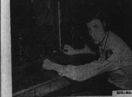
Young Radioman in Japan

Rubies were the first gems to be made synthetically on a commercial scale.