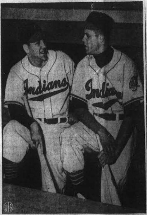
PUPIL GETS MASTER'S POST —Lou Boudreau (left), Cleveland Indians' manager, gives some advice to his replacement at shortstop, rookie Ray (Ike) Boone. The latter responded with seven hits in his first two games as a regular. Boudreau has gone back to playing third base for the first time since his minor league days.