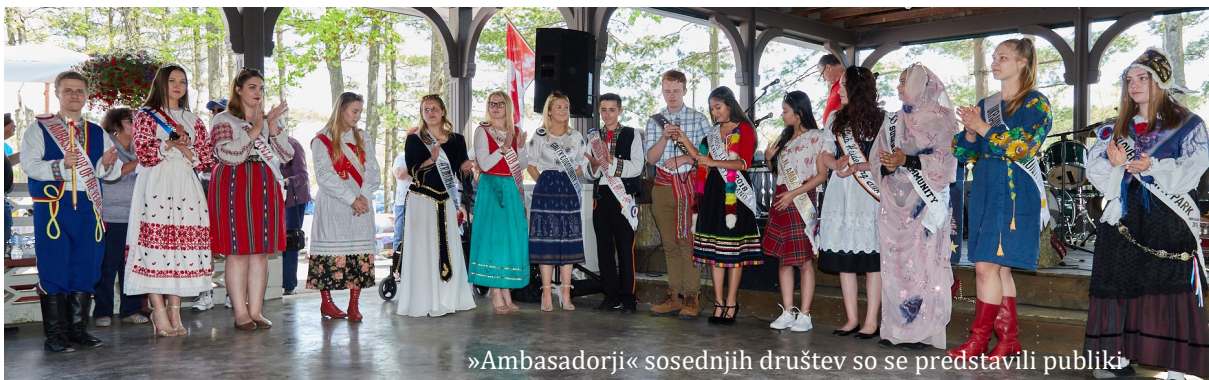
»Ambasadorji« sosednjih društev so se predstavili publikii