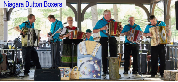
Niagara Button Boxers