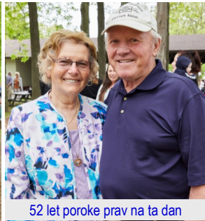
52 let poroke prav na ta dan