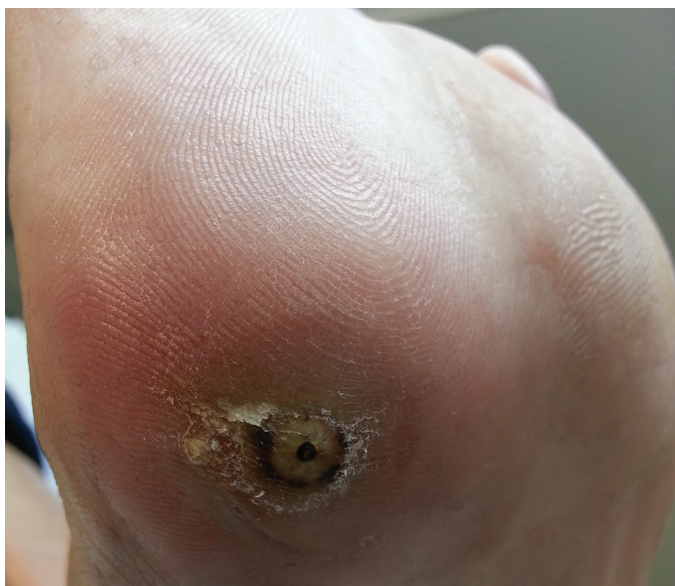
Figure 2 | Patient 2, left plantar nodule with crateriform black central area and thick peripheral scaling.