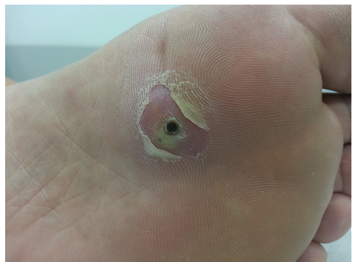
Figure 1 | Patient 1, left plantar nodule with crateriform black central area and thick peripheral scaling.

Both patients stated that they had walked barefoot on the beach. Combining the clinical and dermoscopic data, a diagnosis of tungiasis was made and a surgical excision was performed. In both cases the histopathological examination revealed an oval structure immediately beneath the stratum corneum bordered by a thick capsule with multiple eggs and parasite exoskeleton fragments morphologically compatible with Tunga penetrans (Figs. 4–5). Both patients were given tetanus booster doses and there was no need for systemic antibiotics. The surgical excision was curative with complete recovery after 2 weeks.