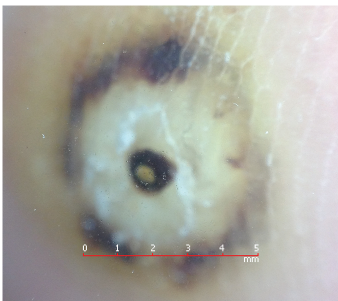
Figure 3 | Patient 2, dermoscopy: note the white halo corresponding to the enlarged abdomen of the parasite, the peripheral bluish-gray areas corresponding to the exoskeleton, and the central pore with a brown structure corresponding to the posterior part of the parasite.