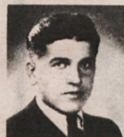
D O L F I 16.1.22 † 2.5.43