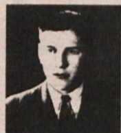
C I R I L 11.2.25 † 27.12.42