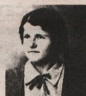
M I C I 7.5.26 † 27.12.42