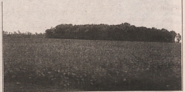
We noticed these tree "islands" in the middle of cornfields. Does anyone know their purpose?

We checked in and were road weary. Having eaten