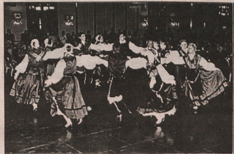
The Kres Dancers