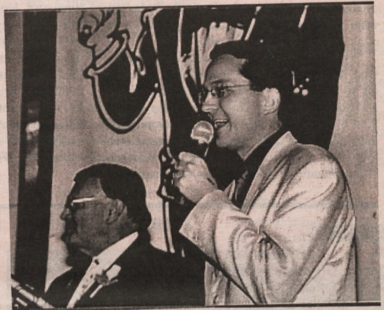
Consul General of the Republic of Slovenia Zvone Žigon