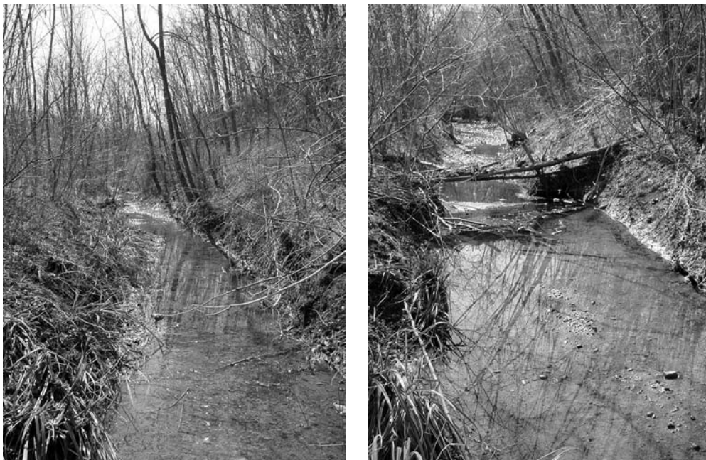
Figure 4 (left) and Figure 5 (right): Two aspects of the Rio Sniardar stream near Brazzano (Loc 3) above the place where it joins the Rio Fidri stream. Its shallow water, slow current, appropriate fine substrate and natural bank vegetation constitute an ideal habitat for Cordulegaster heros .

Slika 4 (levo) in Slika 5 (desno): Dva pogleda na potok Smjardar pri Bračanu nad izlivom v potok Fedrih (Lok 3). Plitva voda, miren tok, droben substrat ter naravna obrežna vegetacija sestavljajo idealen habitat za velikega studenčarja.