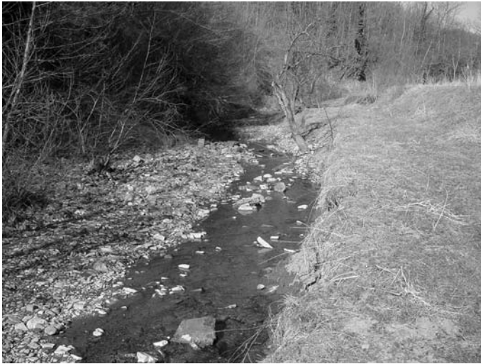
Figure 3: Groina Stream NW of Gorizia, 750 m above the place where it joins the Isonzo river (Loc 1a). Suitable Cordulegaster heros microhabitat in the stream is very scarce, the bottom is too stony and at least some stream sections probably dry up during the summer.

three new Italian localities in the surroundings of Gorizia and Cormons are certainly not the only ones, the potential habitat of C. heros in Italy is very limited and the species therefore definitely rare and endangered. South of Gorizia, there are no streams due to the area's karst landscape, but to the north some streams around Corno di Rosazzo and east of Cividale look very promising - at least on the map. In the field, there is indeed "...the turn of Italian odonatologists now."