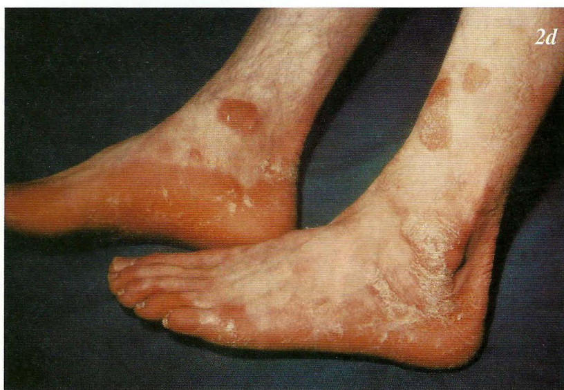
Figure 2. Photographs showing the different phenotypes of diffuse palmoplantar keratodermas (PPKs): (a) hyperkeratosis of the sole in non-epidermolytic palmoplantar keratoderma (NEPPK); (b) Pseudo-ainhum on the fingers in Vohwinkel's syndrome; (c) and (d) erythrodermia variabilis (EKV) with palmoplantar hyperkeratosis and erythematous keratotic patches.