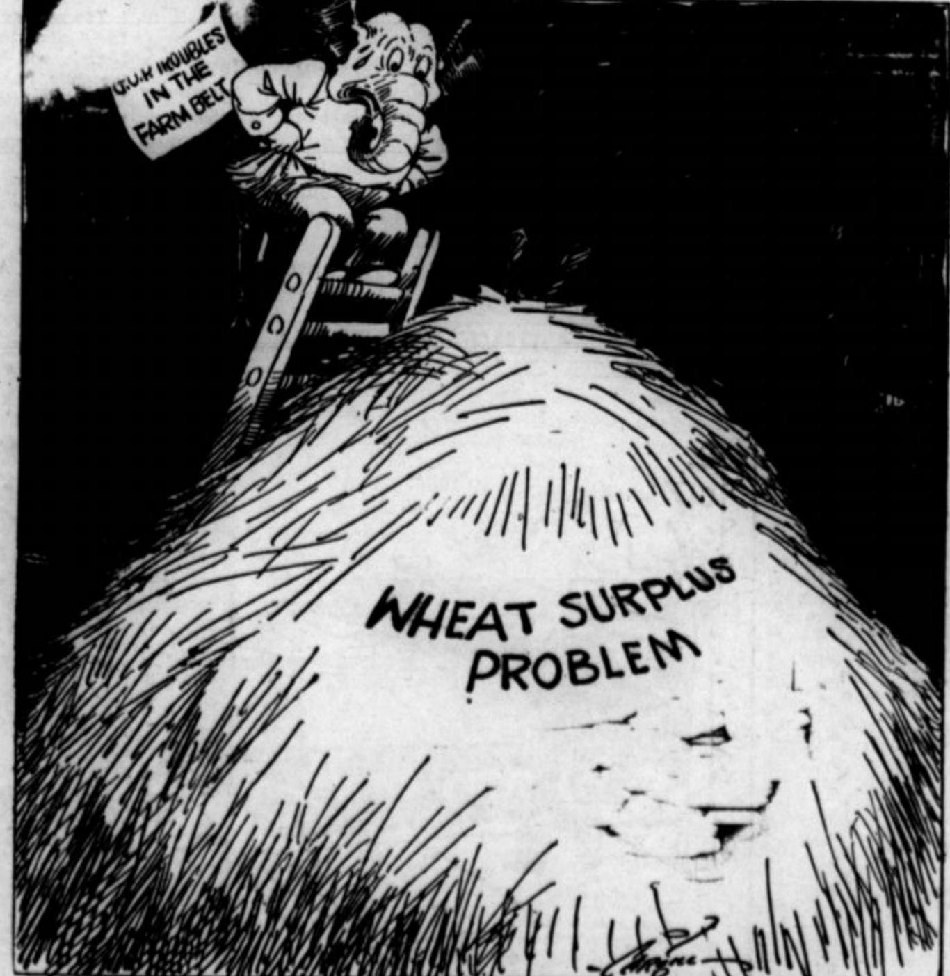
A sensible way: Give to the Hungry an Opportunity to Earn and Buy Food. Then There Will be no Surplus of Labor and Food to Worry About.