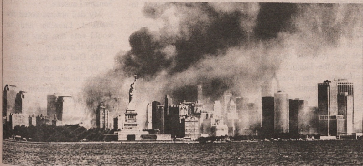
The Statue of Liberty stands in the foreground as smoke billows from the World Trade Center.