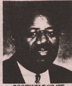
ROOSEVELT COATS WARD 10