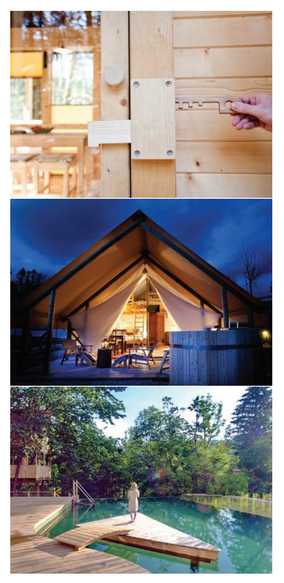
Slika 5: Različni značaji Garden Village Bled glamping letovišča. Figure 5: The different characters of Garden Village Bled glamping resort.