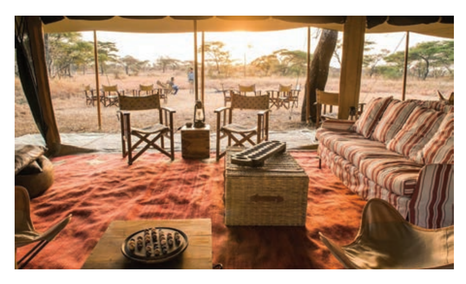
Slika 4: Glamping Nomad Tanzanija Serengeti Safari camp v Afriki, ki sledi migracijam čred divjih živali v parku Serengeti.

An outdoor spa area consists of a sauna, massage and Kneipp area, a natural stream with pebble beach and yoga and meditation areas. The resort, especially the forested part, leaves nature free with all the new construction raised from the ground. This decision created the space and the opportunity for nature to reclaim and revitalise the degraded landscape. The main building material of the resort was (larch) wood, locally sourced and treated without chemicals, with natural