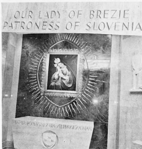
DEL OLTARJA SLOVENSKE KAPELE MARIJE POMAGAJ

Modre besede, vredne tehtnega premisleka. Baragove besede, vklesane v steni kapele nas pri tem le vzpodbujajo: "Kar želim je le to, da bi bil tam, kjer me Bog hoče..." Tudi mi smo po božji volji tam, kjer smo. In kjerkoli smo, bodimo Bogu hvaležni za vse, kar je vzel in še bolj za vse, kar nam