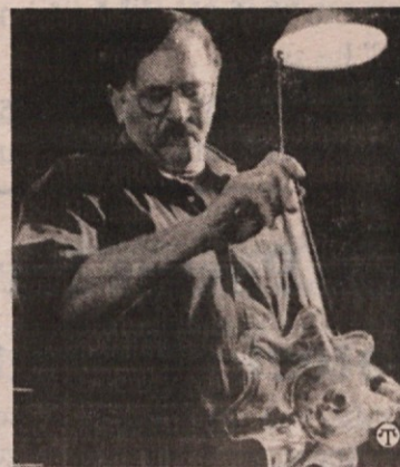
Watch craftsmen make glass objects at The Hot Glass Show of The Corning Glass Center and Museum.

After the Center you can take a trip to Market Street, a charming