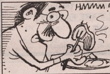
In Canada, Canadian bacon is known as ham.

The concert starts at 3 p.m. in the Cuyahoga Community College Auditorium at E. 30 th and Woodland Ave., in Cleveland.