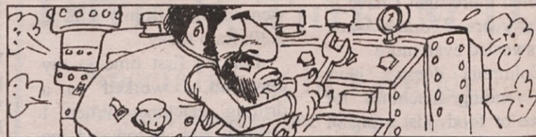
The diesel engine is named for Rudolf Diesel, a German engineer who developed the device in 1897. In 1913, he mysteriously disappeared aboard a ship bound for London.