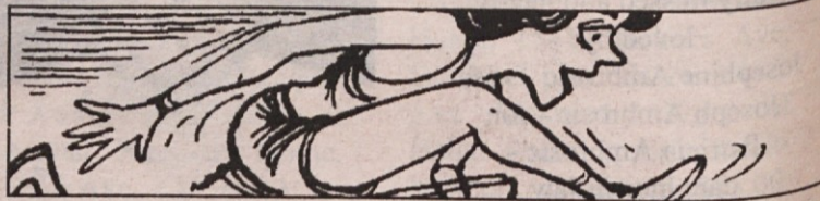
While only 19 women competed in the 1900 Summer Games in Paris, 3,800 women were among the 10,800 athletes who competed in Atlanta in 1996.