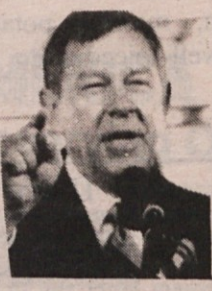
Sen. George Voinovich

CLEVELAND -- U.S. Senator George V. Voinovich (R-OH) last Friday invited Cleveland residents to share their personal stories of how the current energy crises has impacted their lives. The meeting was held at St. Augustine Manor on Detroit Ave., in Cleveland.