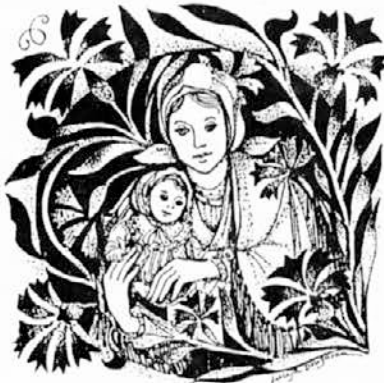
Blagoslovljene Božične Praznike in Srečno Novo Leto