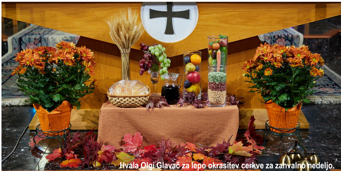
Hvala Olgi Glavač za lepo okrasitev cerkve za zanvalno nedeljo.