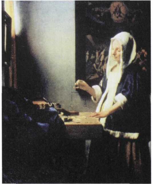
Fig. 5: Jan Vermeer van Deft, Woman Weighing Pearls (1662-1663)

The goddess's gender as mediated by this comparison with Vermeer's painting is relevant here if we recall the contrast between male and female variants of moral reasoning posited by feminists like Carol Gilligan and Seyla Benhabib against moral theorists like Lawrence Kohlberg and John Rawls. 16