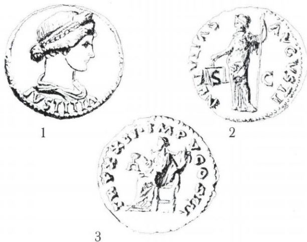
Fig. 1: Roman coins dedicated to Justice and Impartiality. Justitia's sword is not yet in place in these images, which show her with a staff instead.

Allegorical images of Justice, historians of iconography tell us, 1 did not always cover the eyes of the goddess, Justitia. In its earliest Roman incarnations, preserved on the coins of Tiberius' reign, the woman with the sword in one hand, representing the power of the state, and the scales in the other, derived from the weighing of souls in the Egyptian Book of the Dead, 2 was depicted as clear-sightedly considering the merits of the cases before her (fig. 7). Medieval images of justice based on figures of Christ, St. Michael, or secu-