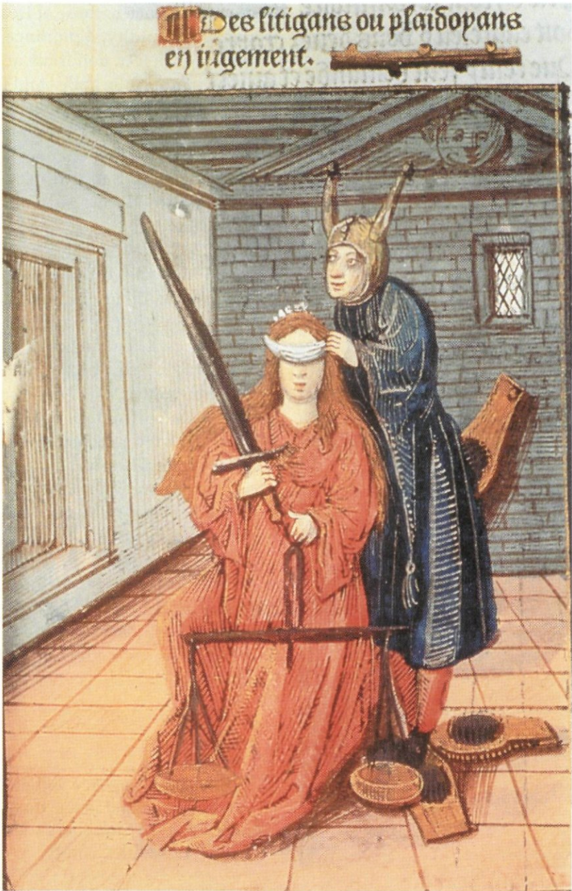
Fig. 3: The fool ties the eyes of Justice. S. Brant, La nef des folz du monde ; French transl., Lyon 1497.