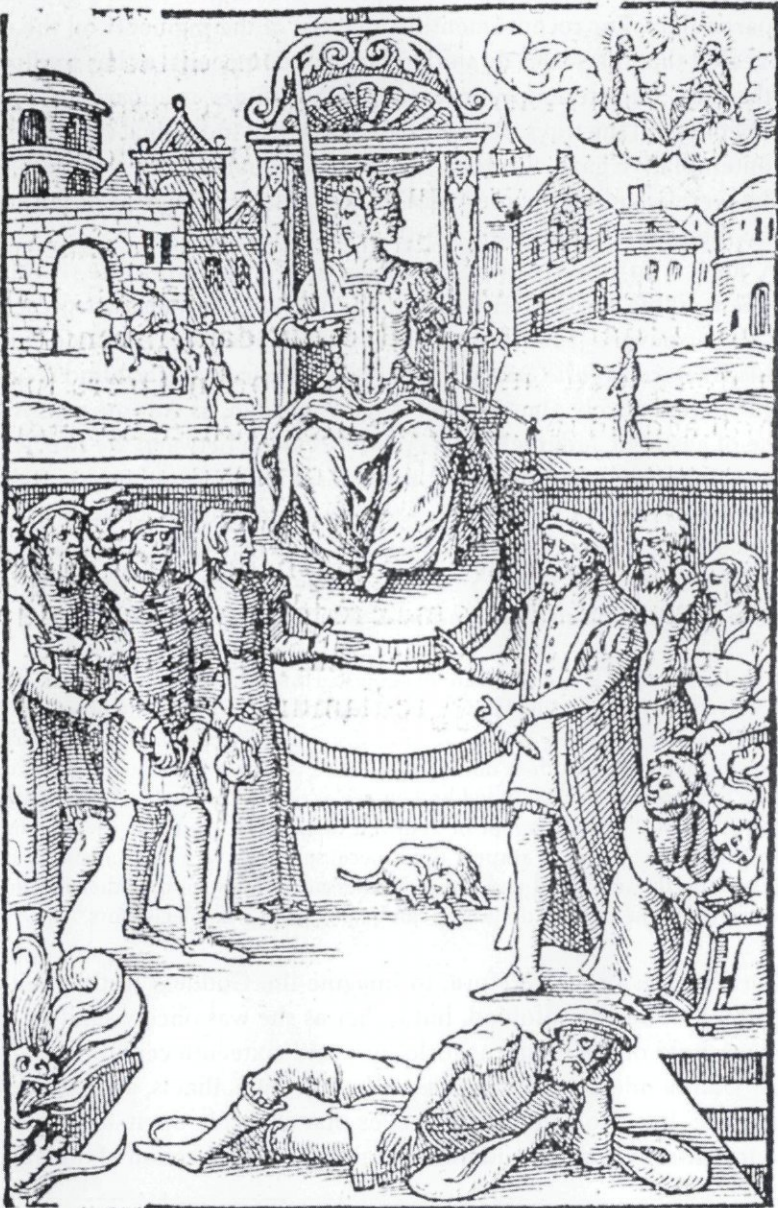
Fig. 6: Justice with two faces, one veiled and the other with open eyes. Frontispiece of J. De Damhoudere, Praxis rerum civilium... , Anvers 1567.