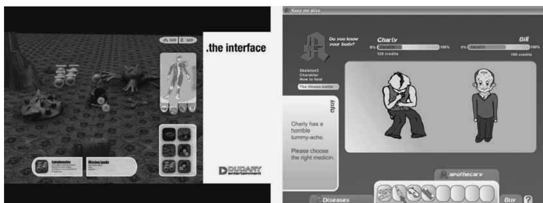
Figure 2: Student Designs

With the intention of outlining the potentials of applying games in the area of medicine (as a serious discipline in contrast to the computer games that are often seen simply as a leisure activity or even as a waste of time), some