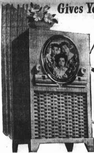
The Zenith WILDFLOW. Has "Big B" Giant Circle Screen, Bulls Eye Automatic Tuning for all 12 channels, Zenith-Armstrong FM for superb tone. Modern console of imported Alamo veneer, hand-rubbed to a lustrous blonde finish. $489.95

... one knob, one twist—there's your station, your picture, your sound! No more "fiddling" to keep the picture steady or to tune it properly when switching to another station!