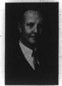
By STEPHEN M. YOUNG Ohio Congressman-at-Large

Washington. — Everett Dirksen, (R), Illinois Congressman, entered the House of Representatives in 1933. He retired voluntarily in 1948. Although a young man, his eyesight was failing. Doctors told him it was malignant — this being a polite medical term for cancer. Congressman Dirksen's constituents were inordinately proud of him and reelected him by overwhelming margins. He was one of the nation's great men and a most valuable Congressman. He was an influential member of the powerful Appropriations Committee. No doubt intensive reading of documents pertaining to appropriations affected his vision. Following his retirement from Congress, his eyesight rapidly improved. His present doctors report there is no indication of malignancy; that he never had cancer. The nation lost a splendid public servant because some doctor made a poor guess.