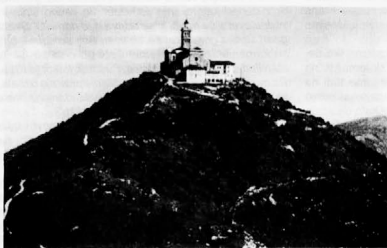
SVETA GORA — PRILJUBLJEN ROMARSKI KRAJ