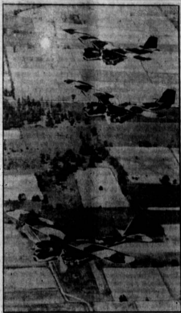
Vojaški aeroplani na manevrih nad Daytonom, O. Zdjaj so bili mirni, a kaj lahko se pride?

Chicago. — Junjska suša je požgala letino pšenice v Nebraska in naredila veliko škodo v drugih državah. Ta dogodek bo pomogel več, ko vsi zakoni, ki jih je diktiral Roosevelt kongresu, da porastejo cene pšenice. Vse kaže, da letos ne bo treba na umeten način omejiti pridelka pšenice; suša bo to storila.