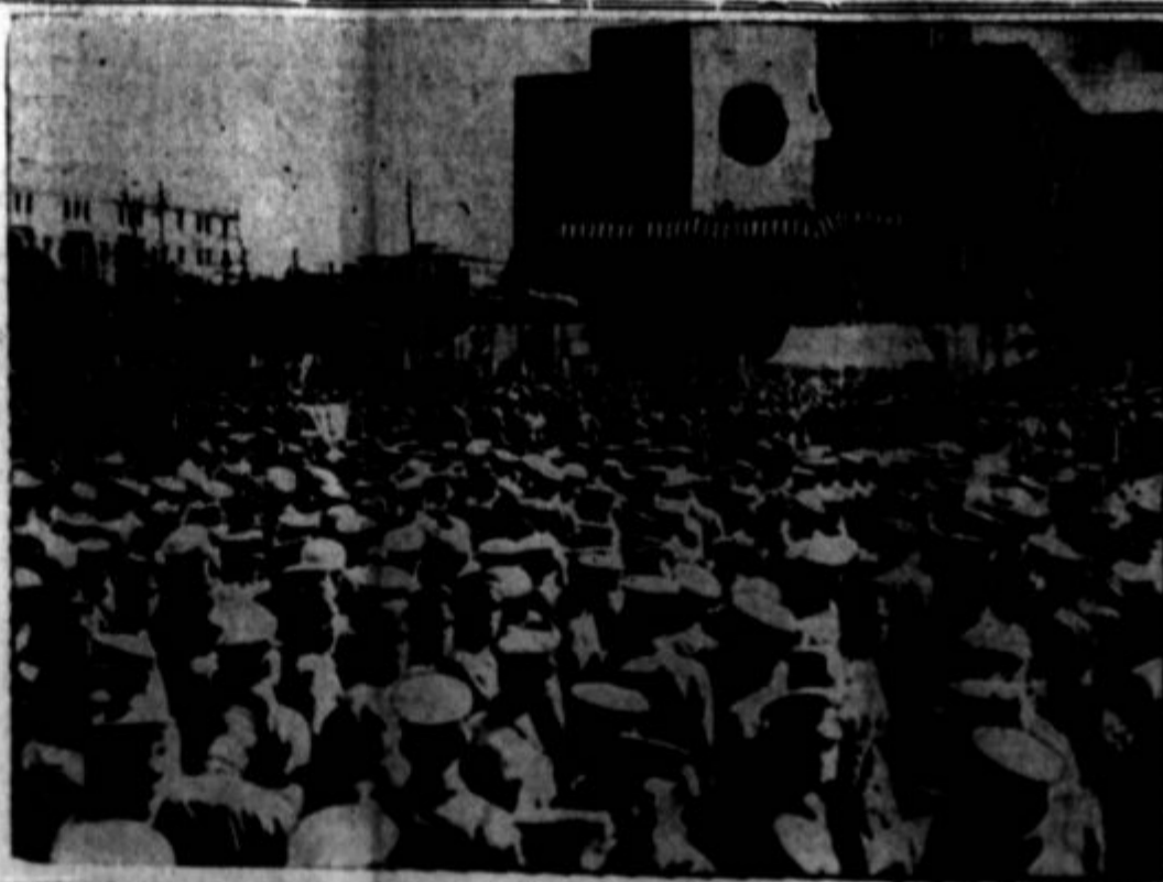
Vojaške demonstracije v Tokiju v pri log izstopa Japonske in Lige narodov.

Glavni govornik na tem niku bo dr. František Soukup, socialistični vodja na Čeh in predsednik čehoslovake senata. Park odprt ob dopoldne.